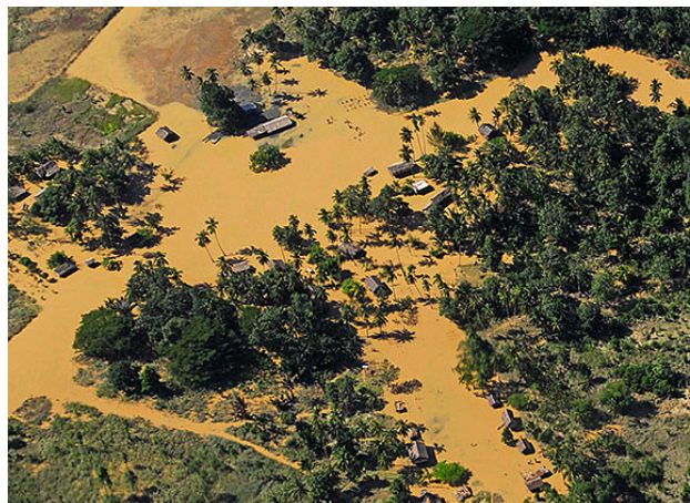
Oro Province, 2007